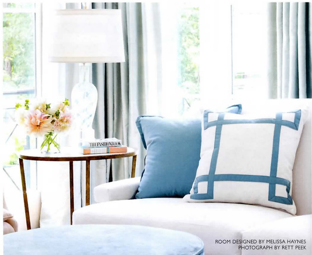
ROOM DESIGNED BY MELISSA HAYNES

"This is a timeless trend that can be used on anything and everything in your home—from headboards and seating to walls and ceilings—and in all design styles, from traditional to modern." — Lindsey Binz