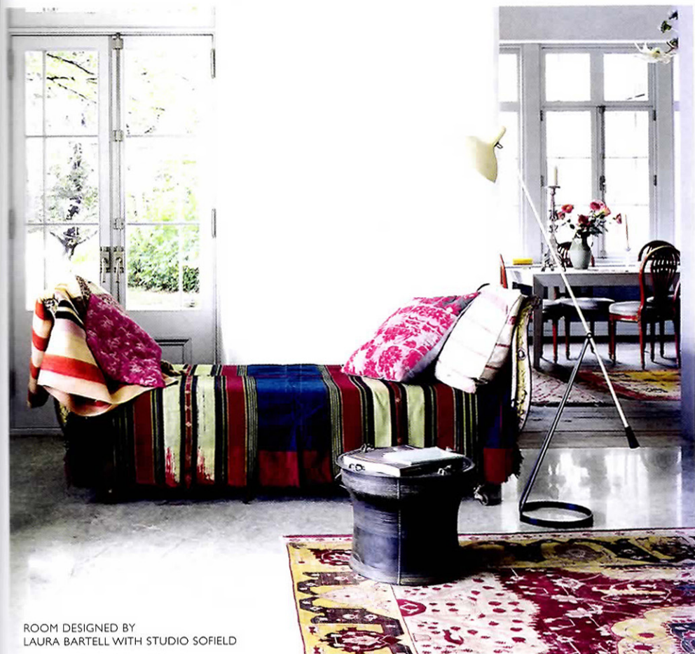
ROOM DESIGNED BY LAURA BARTELL WITH STUDIO SOFIED