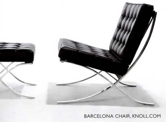
BARCELONA CHAIR, KNOLL.COM