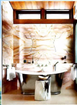
ROOM DESIGNED BY LAURA BARTELL WITH STUDIO SOFIELD