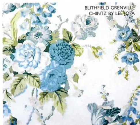
BLITHFIELD GRENVILLE CHINTZ BY LEE JOFA